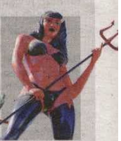
Name: Diablo's She-Devil Height: 16' Location: Diablo's Cantina, Monte Carlo