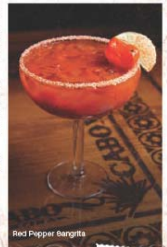
Red Pepper Sangrita

Cabo Wabo Cantina serves lunch, dinner and a late-night menu. Call 702-385-2226 or visit www.cabowabocantina.lv.com